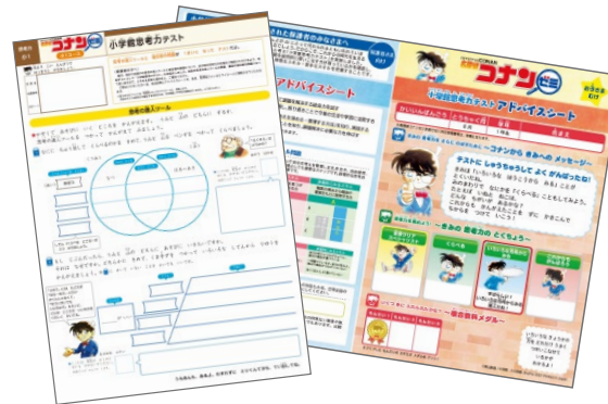
Shogakukan Thinking Skills Test and Advice Sheet