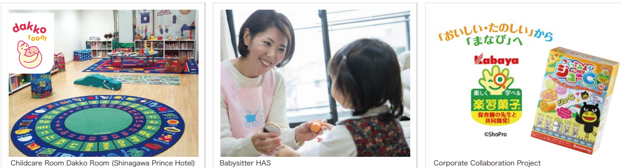
Childcare Room Dakko Room (Shinagawa Prince Hotel)